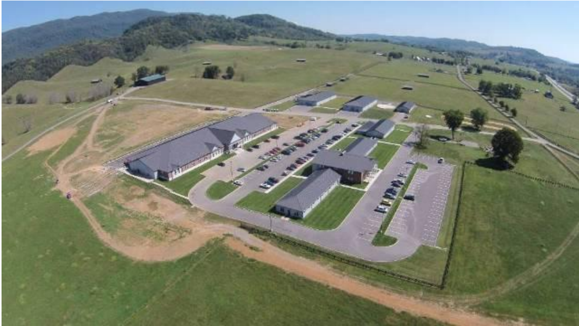
Picture of DeBusk Veterinary Teaching Center (DVTC)

The Veterinary Teaching Center provides students around the country the opportunity to practice veterinary medicine on cows, horses, and small animals. Virginia Tech's Office of Economic Development conducted a project where they explored how the Veterinary Teaching Center could function as an anchor institution for Lee County.